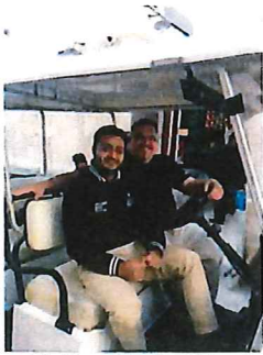
My New Muslim Friend