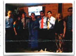
Group of Bible College students

The Bible College still has a debt of $38,000 on the property due in May. Would you pray about helping us retire that debt by the May 15 due date? You can designate a gift to "The Chile Bible College" or visit 250project.com for more information on how to be a part of the ministry in Chile.