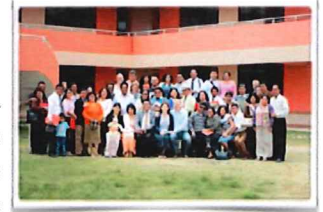
Pastors and wives, Arequipa Peru