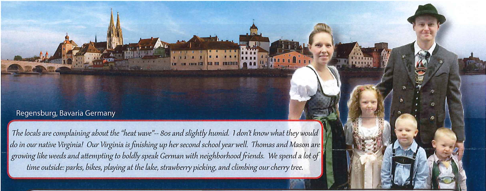
Regensburg, Bavaria Germany