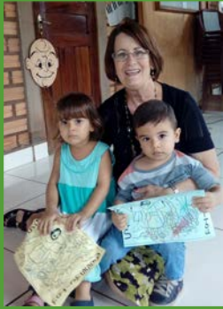
A Few of Our "Littles"