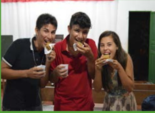
A Few of Our Teens