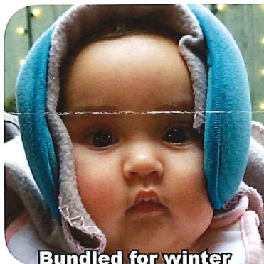
Bundled for winter